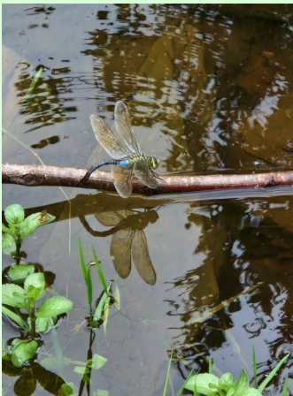
Female Emperor Dragonfly seen at the first pond

If you would like to get involved contact Telscombe Town Council on 01273 589777. The volunteer group meet at 11am on the first Sunday of each month in the car park by Wander Coffee. We hope they will continue to grow and go from strength to strength.